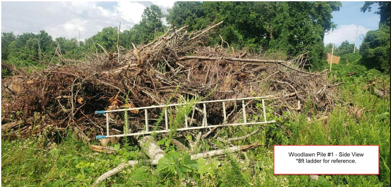
Woodlawn Pile #1 - Side View *8ft ladder for reference.