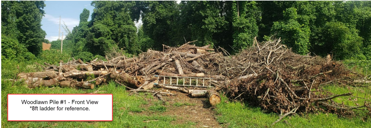
Woodlawn Pile #1 - Front View *8ft ladder for reference.