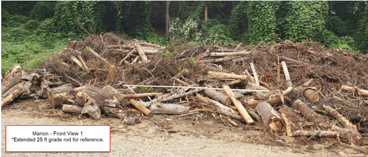
Marion - Front View 1 *Extended 25 ft grade rod for reference.