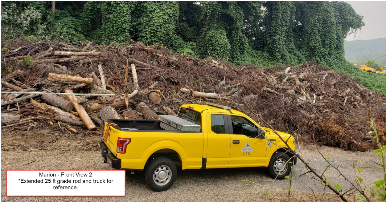
Marion - Front View 2 *Extended 25 ft grade rod and truck for reference.