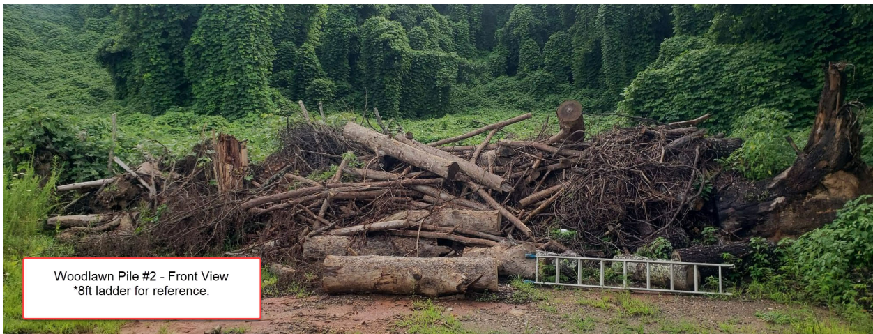
Woodlawn Pile #2 - Front View *8ft ladder for reference.